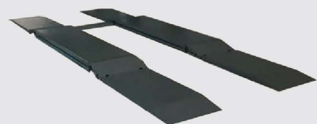
Platform Extension (optional)