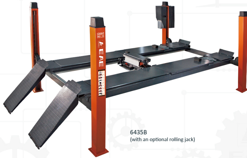
6435B (with an optional rolling jack)